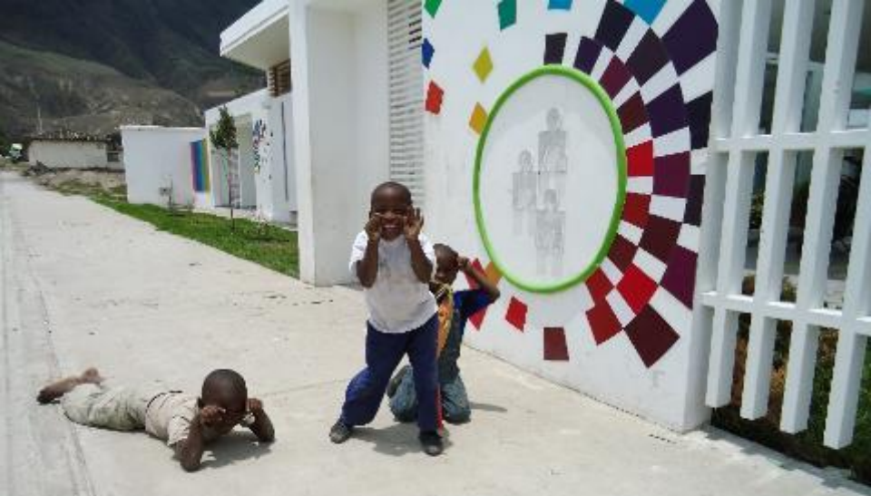
THE REAL BENEFICIARIES